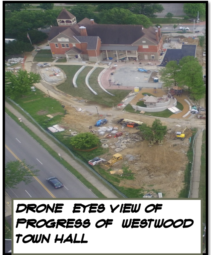
DRONE EYES VIEW OF PROGRESS OF WESTWOOD TOWN HALL