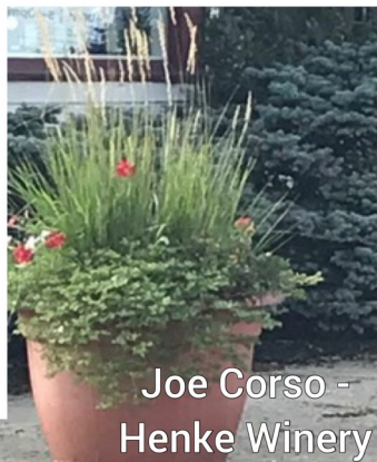
Joe Corso - Henke Winery