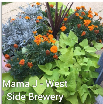
Mama J - West Side Brewery

If you are interested in gardening at WCG we have plots available and the 2018 Application is available online at http://westwoodcivic.org/initiatives/westwood-community-gardens/application-rules/