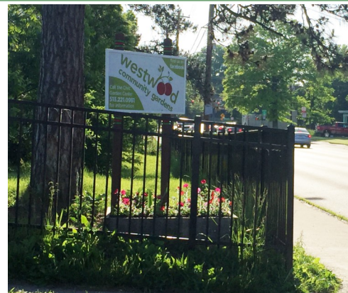
WCG's recently reinstalled sign with new planting bed

If you are interesting gardening at WCG we have plots available and the 2018 Application is available online at westwoodciv-ic.org/wp-content/uploads/2017/11/WCG-Application- Flyer2018.pdf