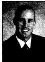
Circle of Excellence 99-04 OAR President's Sales Club 96-04 Licensed in Ohio & Kentucky